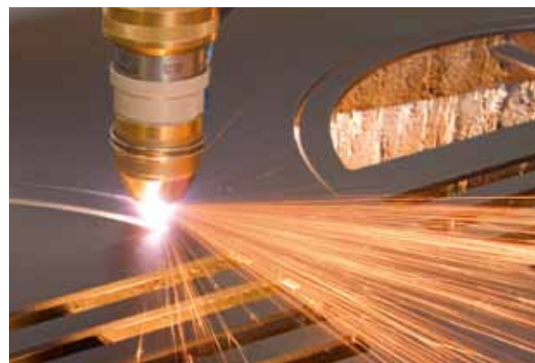
Kjellberg Finsterwalde Elektroden und Maschinen GmbH develops technology for the HiFocus-plasma cutter in Finsterwalde

Berlin-Brandenburg offers a large innovation landscape and currently the highest research density in Europe. Almost 72,000 students are matriculated in mathematical and natural science courses. The German capital region has well-known nationally and internationally cross-linked research and development institutes at its disposal. These are highly dedicated to fields like the development of new materials, renewable energies, and innovative processing technologies. In 2011, the FORUM Research and Users' Center for Joining and Coating Technology at the Technische Universität Berlin started enabling companies to develop new technological solutions. Efficient networks, different cooperation possibilities and an innovation-friendly ambience turn Berlin and Brandenburg into leading locations for science and research from which investors can profit in every way.