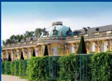
Sanssouci Palace in Potsdam