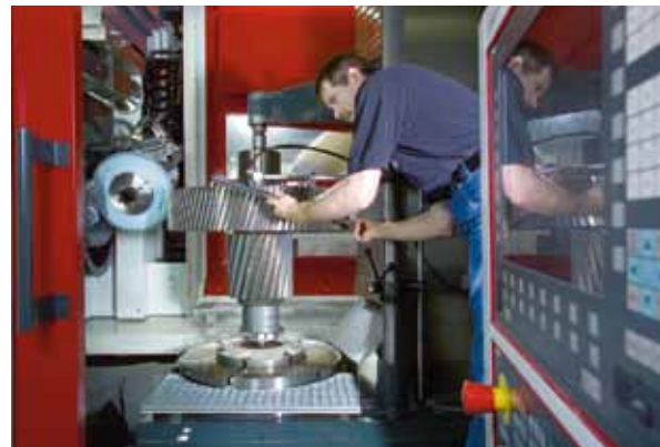
Finishing of toothed wheels for wind-turbine gears on state-of-the-art tooth flank grinding machines, Zahnradwerk Pritzwalk GmbH in Pritzwalk

Two closely cooperating company-networks represent excellent platforms for successful networking. "M+E-Netzwerk" and "profil-metall" bundle the industry's expertise in the region, enhance cooperation between companies, research institutes, and stakeholders, support the expansion of the market access and the increase of the market communication and do lobby work. Breaking down market access barriers, establishing supply and value chains, and developing successful strategies for the maintenance of qualified employees are topics in the focus of the networks' activities. Furthermore, the investors get comprehensive support during the set up of their companies.