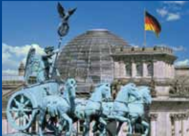
Quadrige and Reichstag building