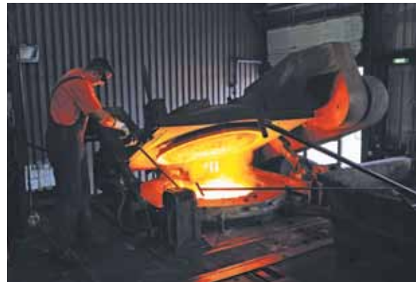
Ortrander Eisenhütte: Induction furnace with state-of-the-art particle suction device

The steel industry in the capital region is represented by three international large-scale companies that are successfully distributing their innovative products all over the world.