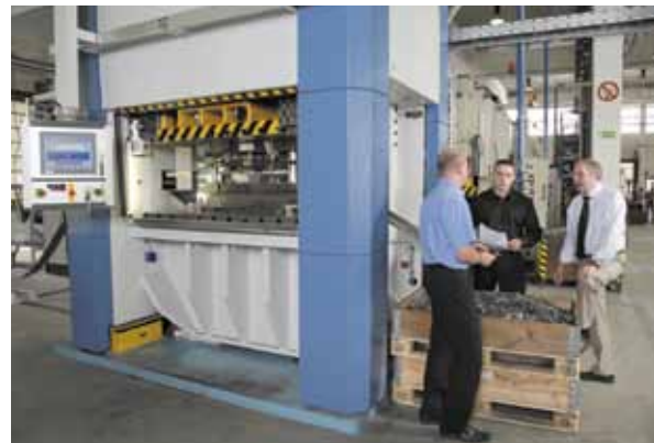
Inspection of transmission parts at the EBU STA 320 punching press of Ahlberg Metalltechnik GmbH in Berlin-Reinickendorf