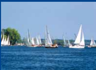
Excellent leisure facilities in the region