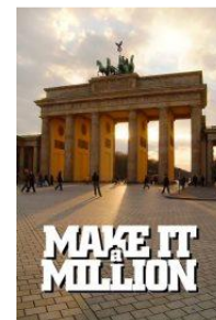
Successful Facebook campaign.

We did it! Berlin now has over one million fans on Facebook, which makes it the world's second most popular city next to New York. More than 200 video "love letters" to Berlin were submitted in anticipation of the million-fan mark and clearly demonstrate the enthusiasm of the online generation for the German capital. Individuals now have until December 9, 2011 to vote for their favorite video on the Berlin Facebook page . The biggest Berlin fans and their winning videos will receive a number of exciting prizes. Read more about the initiative in this press release .