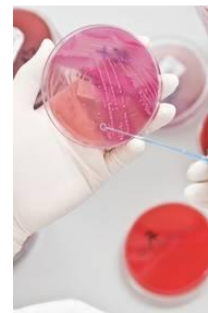
Together, the two laboratories now work faster and in a more innovative and cost-effective manner.

One year ago, Berlin’s Vivantes and Charité hospitals merged twelve of their laboratories. Today, the cooperation known as Labor Berlin has become Europe’s largest hospital laboratory and now is already demonstrating highly positive results. These two Berlin state hospitals were able to save roughly €1 million as a result of their consolidation. Their annual turnover was over €40 million and the number of external contractors continues to rise. Labor Berlin is set to become even more efficient in early 2013 with the completion of a central laboratory building. To find out more, please read this press release issued by the Charité.