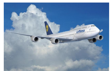
Lufthansa is gearing up to expand its offerings in Berlin.

In 2012, operations at Germany's top airline will pick up speed in the capital region. Lufthansa's Berlin fleet will be expanded from nine to 15 planes and overall seating capacities will grow by approximately 40 percent. Starting in the summer, there will be an additional 30 new destinations reachable from Berlin. The company will invest more than €60 million in their operations at BER airport and hundreds of new jobs are set to be created. Lufthansa announced that the intensification of its operations is the result of the new growth dynamic and market opportunities offered by BER. The company is planning yet another display of their commitment to the Berlin by naming their next A380 "Berlin." To find out more, please read this press release issued by Lufthansa.