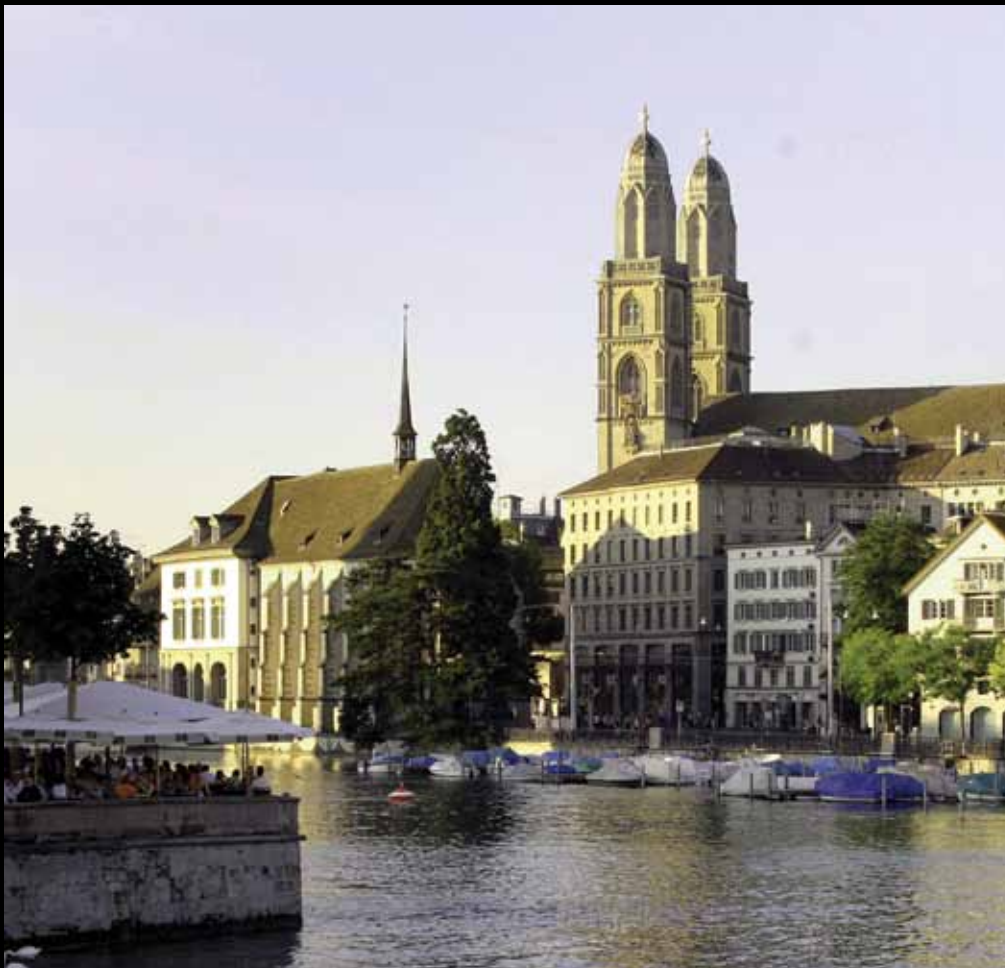
The Greater Zurich Region ranks first for economic potential of all the small regions in Europe