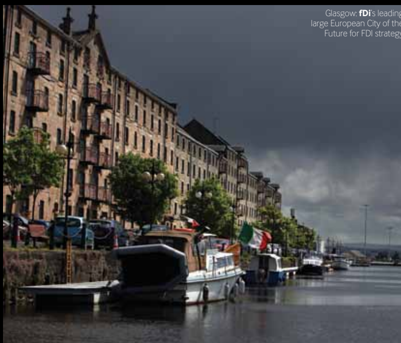
Glasgow: fDi's leading large European City of the Future for FDI strategy