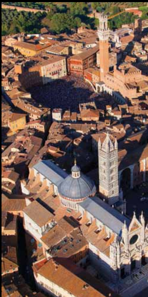
Tuscany ranks top southern European region for FDI Strategy