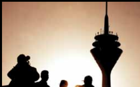
Fertile: Nordrhein-Westfalen, home to the city of Dusseldorf, tops the overall regions ranking for European Region of the Future 2014/2015

Note: List restricted due to shortage of suitable entries.