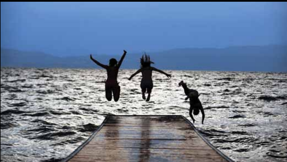
The Ohrid-Struga region: number one for cost effectiveness in Europe