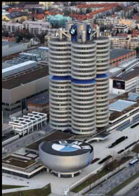
Driving growth: Munich is second in the western European city ranking