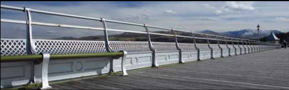
Bangor: number one micro-sized European city for human capital and lifestyle